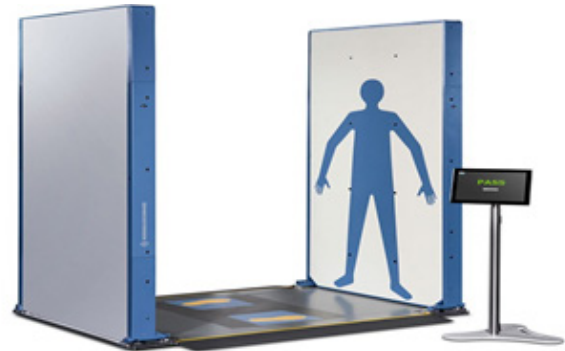
Fig 1. Image of the body scanner

The introduction of the security body scanner helps Kibble to uphold the Secure Care Pathways and Standards Scotland (2020), The Promise and the Care Inspectorates Key Question 7.