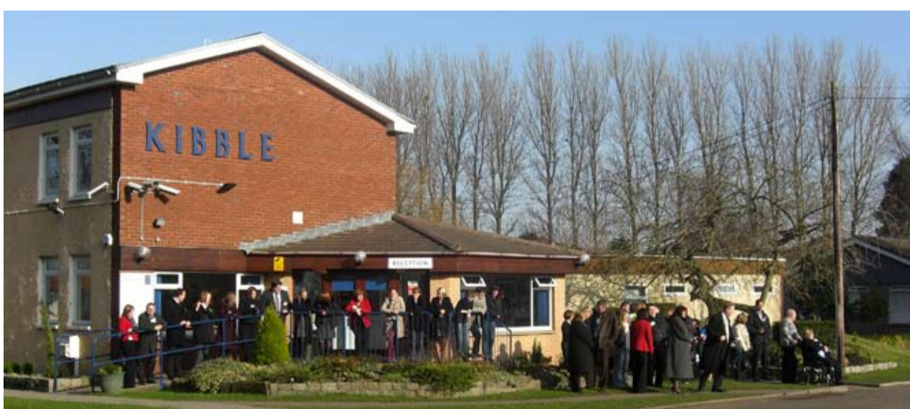
Modern Kibble campus photo